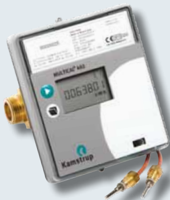
MULTICAL® 402 with threaded sensor

Accuracy class 2 or 3, wide dynamic range ( q_p/q_i 100:1), and the high permanent overload capability ( q_s/q_p 2:1) are standard features.