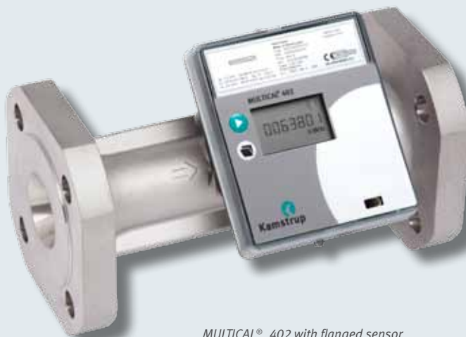
MULTICAL® 402 with flanged sensor