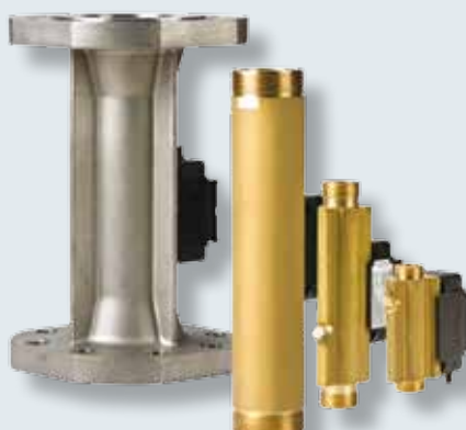
Flow sensors ULTRAFLOW® 54 q_p 0.6 to 40 m^3/h