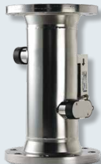
Flow sensors ULTRAFLOW® q_p 60 to 1,000 m^3/h